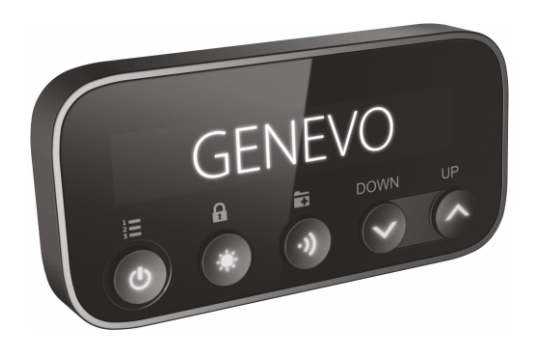
Radar Detector Genevo PRO